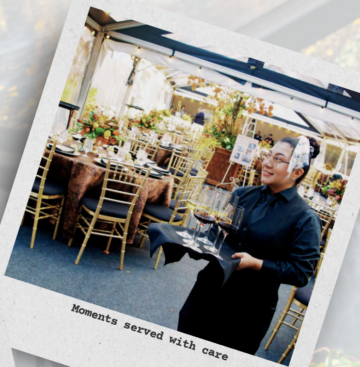
Moments served with care