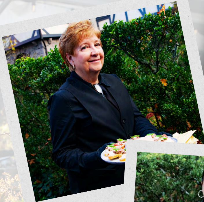
Gentle hands, graceful service