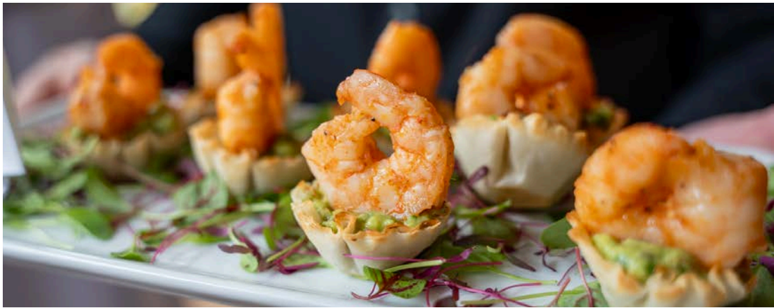
Guacamole Shrimp Cup