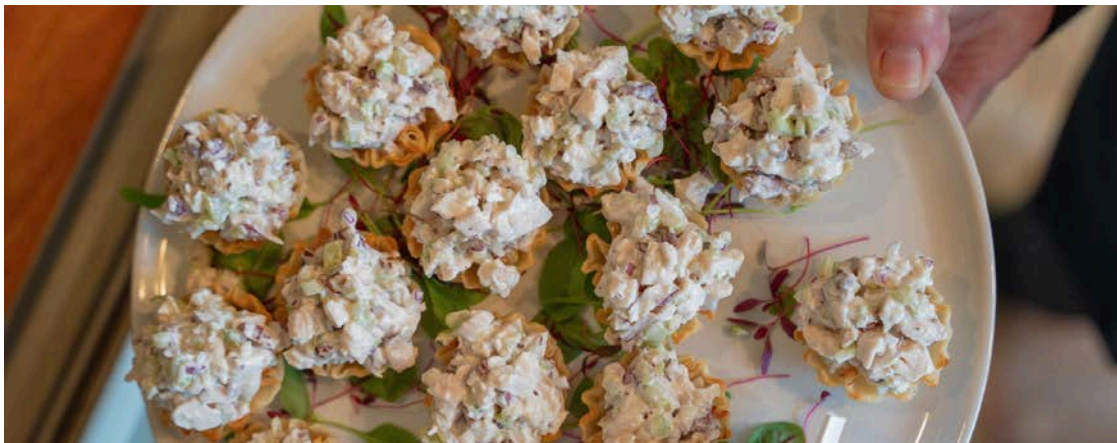
Chicken Waldorf Cup