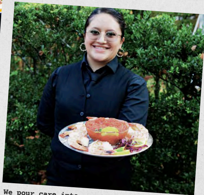
We pour care into every detail